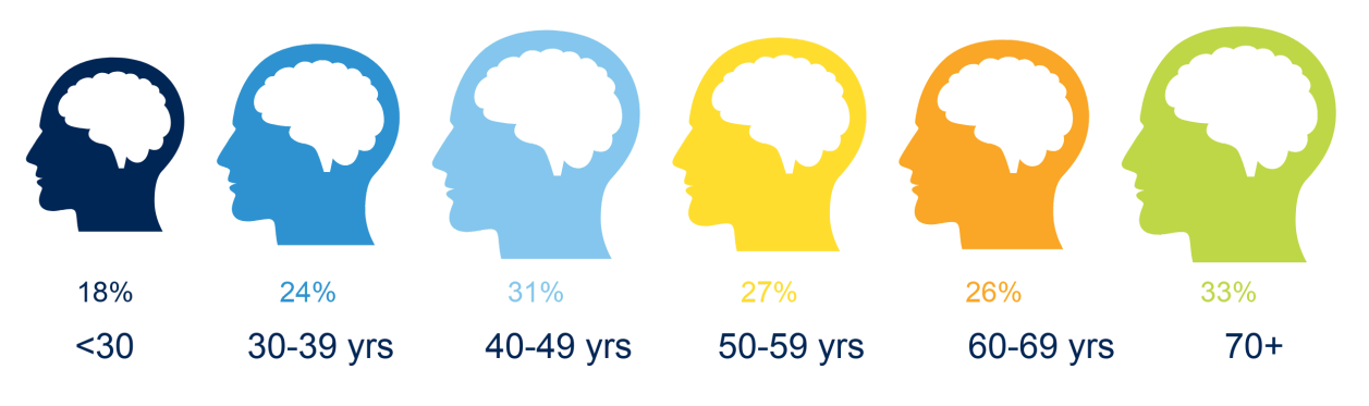
Based on a 2018 Perpetual survey of 3000 Australians.